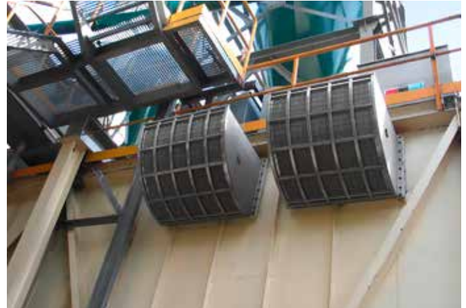
Explosion venting of a chip bunker using the Q-Box to protect the surrounding infrastructure.

The sanitary cover protects the Q-Box against dust from outside sources.