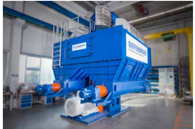
Flameless explosion venting in a grinder machine.