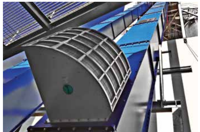
Explosion Safety of a trough chain conveyor using the Q-Box in a biomass power plant.

Consulting. Engineering. Products. Service.