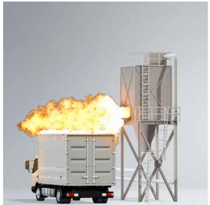
Without TARGO-VENT: The flame endangers operating areas.

Consulting. Engineering. Products. Service.