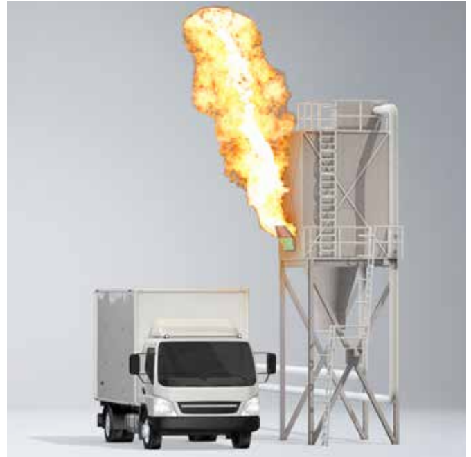
With TARGO-VENT: The flame is deflected into safe areas.